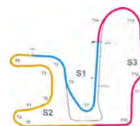
Beijing Goldenport Circuit