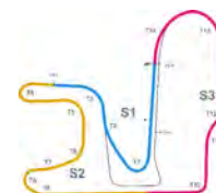
Beijing Goldenport Circuit