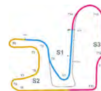
Beijing Goldenport Circuit