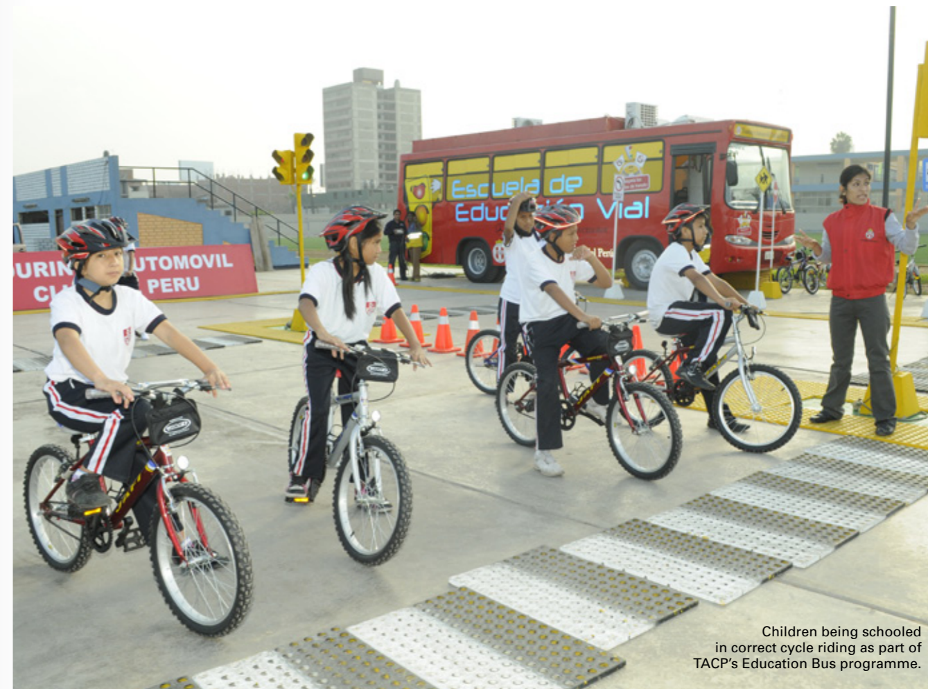
Children being schooled in correct cycle riding as part of TACP's Education Bus programme.