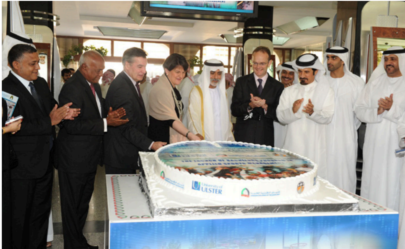
A celebratory cake is cut to mark the official launch of the ATCUAE's BSc (Hons) Applied Sport Management degree.

Association of Touring Clubs of the United Arab Emirates