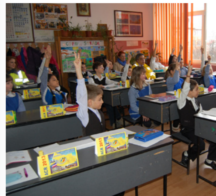
The ACR aims to set up 40 Road Safety labs in schools across Romania.

Automobile Club du Grand-Duche de Luxembourg