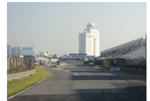
Action from the HKAA's Autosport Challenge.