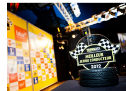
The ACL's young driver contest has become a tradition in Luxembourg.

Automobile Club du Grand-Duche de Luxembourg