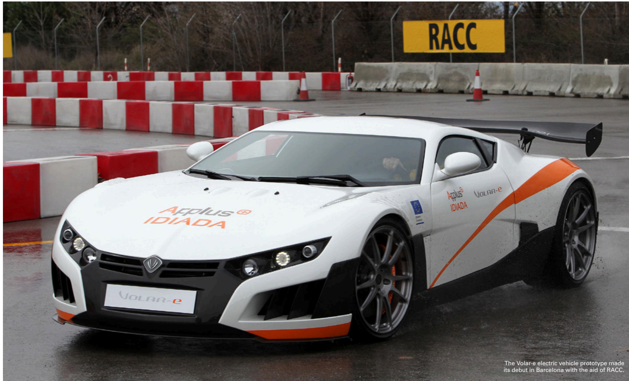
The Volar-e electric vehicle prototype made its debut in Barcelona with the aid of RACC.