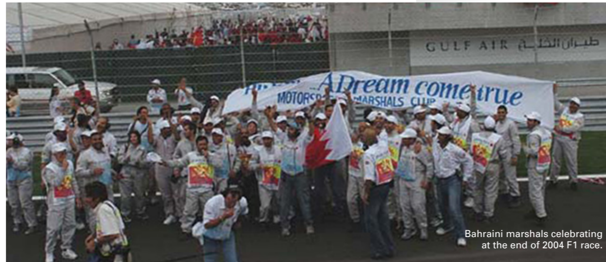
Bahraini marshals celebrating at the end of 2004 F1 race.