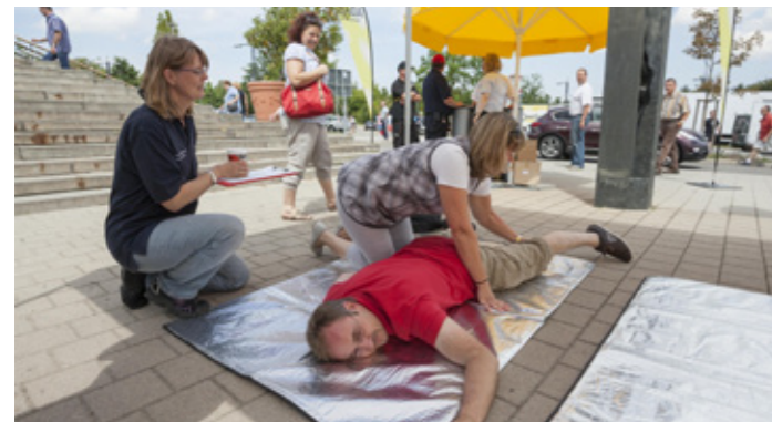
As part of the survey, respondents were asked to demonstrate a correct recovery position for a crash victim. Many, as in this picture, failed the task.