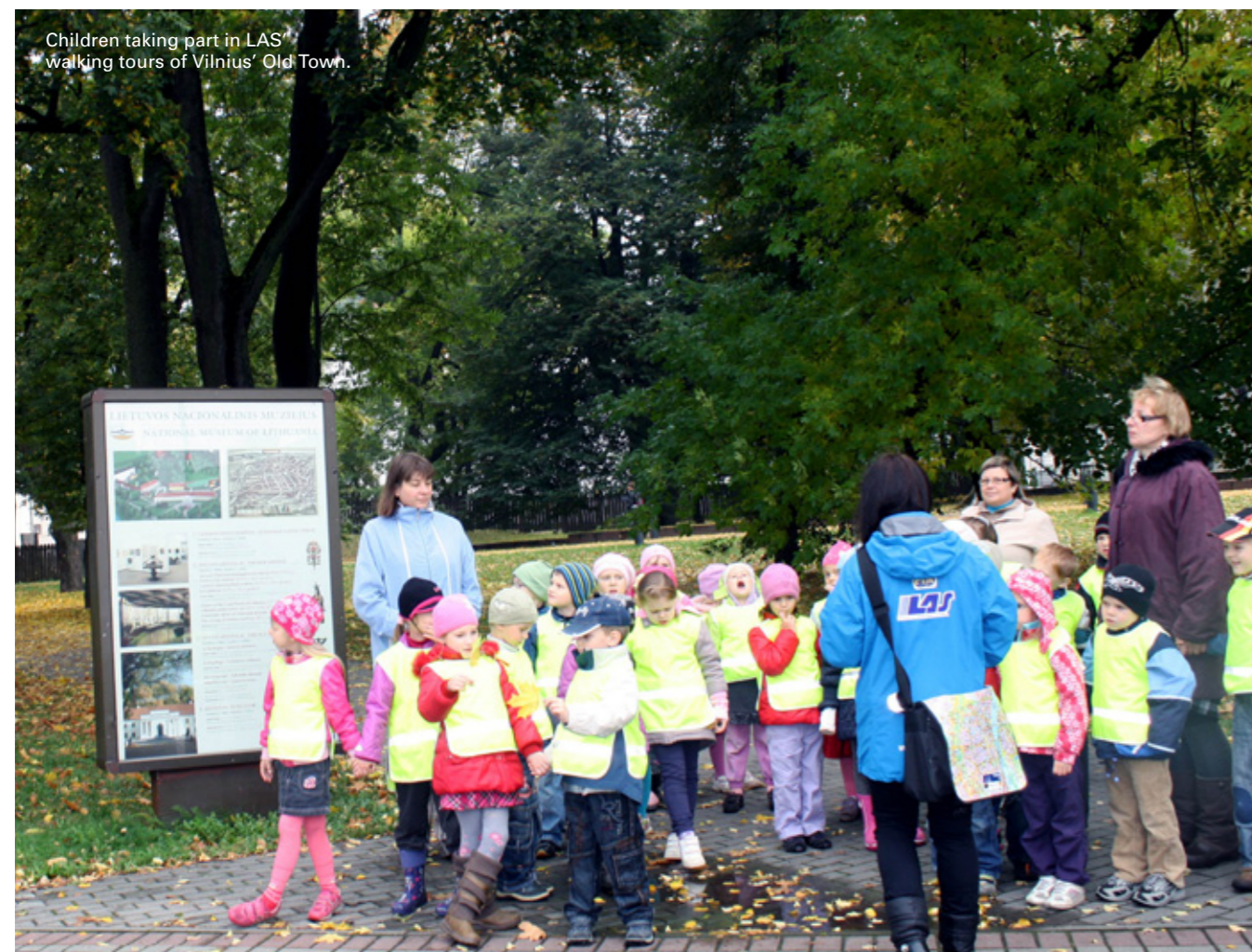
Children taking part in LAS' walking tours of Vilnius' Old Town.