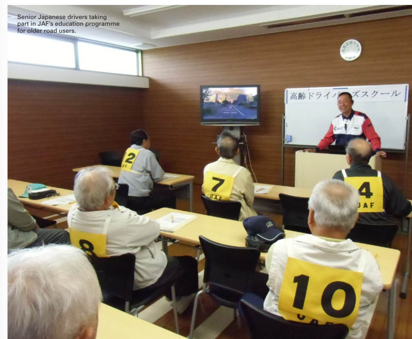
Senior Japanese drivers taking part in JAF's education programme for older road users.