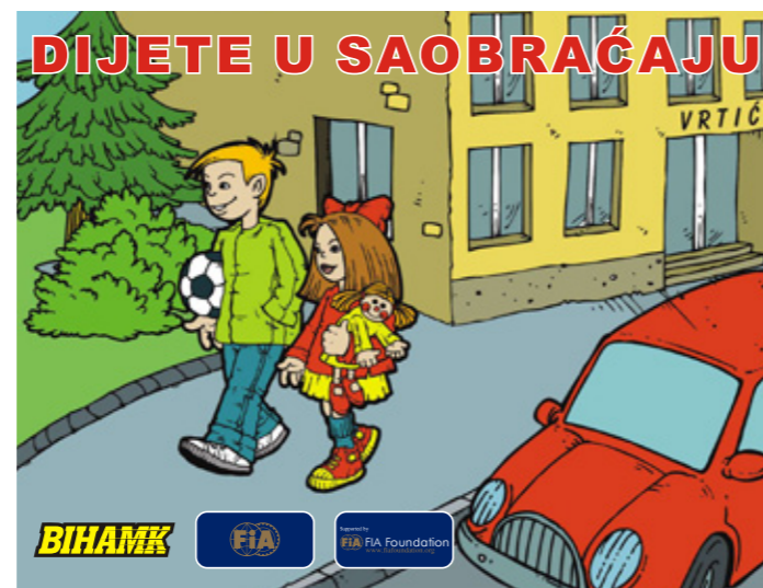
The front page of BIHAMK's coloring book designed for its 'Road Safety for Schoolchildren in B-H' campaign.