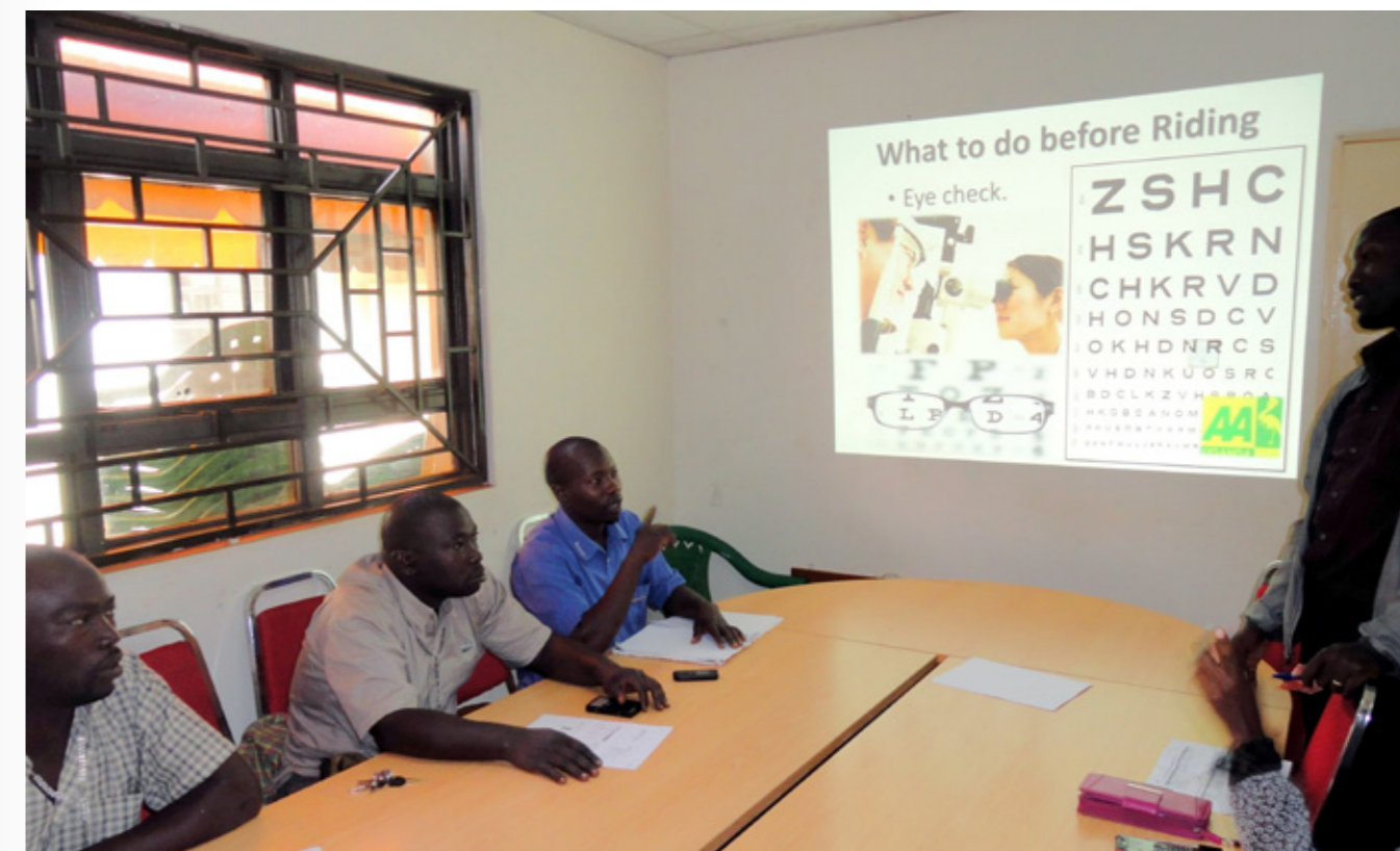
Ugandan motorcyclists receive training in how to school others in safe riding techniques.