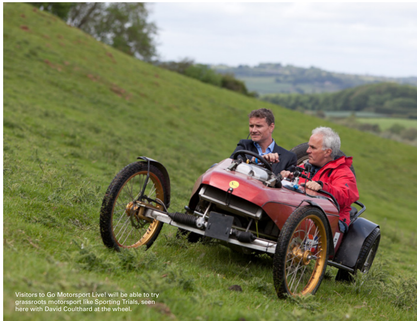
Visitors to Go Motorsport Live! will be able to try grassroots motorsport like Sporting Trials, seen here with David Coulthard at the wheel.

Fédération Française du Sport Automobile