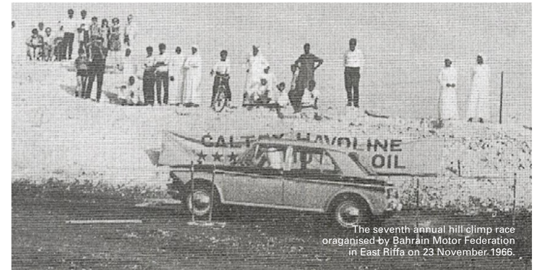
The seventh annual hill climb race organised by Bahrain Motor Federation in East Riffa on 23 November 1966.

Founded on 23 November 1952, the Bahrain Motor Federation hosted its first event the following month and issued an open invitation to all automobile and motorcycle users in the Kingdom of Bahrain to attend.