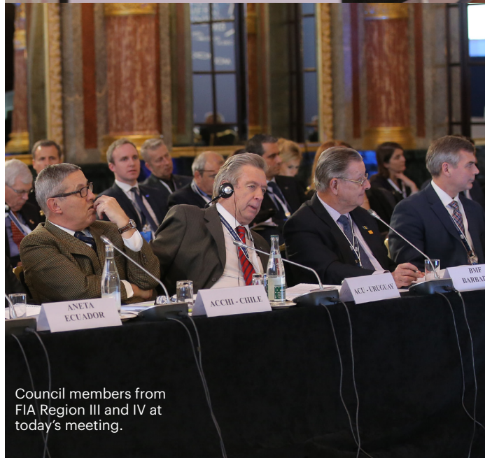
Council members from FIA Region III and IV at today's meeting.